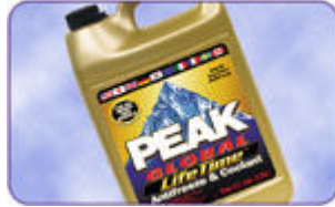
One Gallon (US)