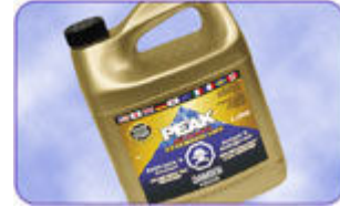
3.78 Litre (Canada)

PEAK Global™ LifeTime™ Antifreeze & Coolant - Antigel/Réfrigérant features a patented, advanced organic acid technology that provides guaranteed LifeTime protection - for as long as you own your vehicle!* Its patented inhibitors will provide maximum protection against damaging rust and corrosion in all automobiles and light trucks worldwide, regardless of make, model, year or original antifreeze color.