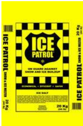
White in Color Melts at 10°F