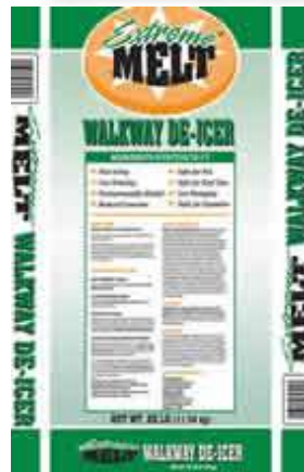
Orange in Color Melts at 5°F