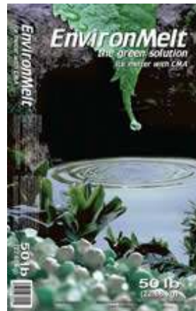
Green in Color Melts at -12°F